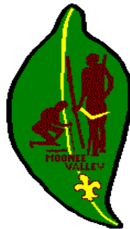
Our Moonee Valley district uniform badge.

The logo on the scarf is representative of the runways at Essendon Airport, with the scout Arrowhead pointing North. This is worn on our scarf.